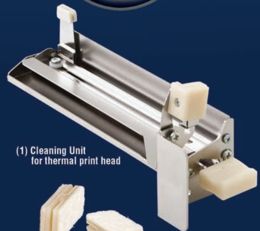
(1) Cleaning Unit for thermal print head