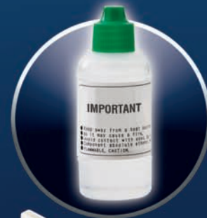
(1) Cleaning Solution Bottle