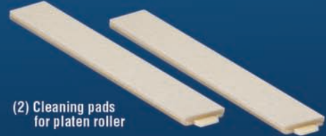
(2) Cleaning pads for platen roller